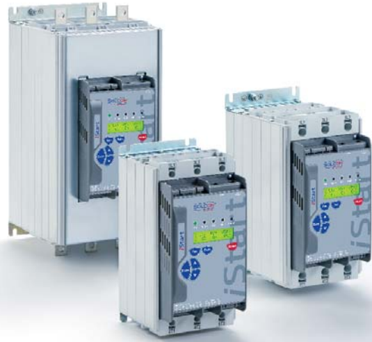
iStart size A, B, C